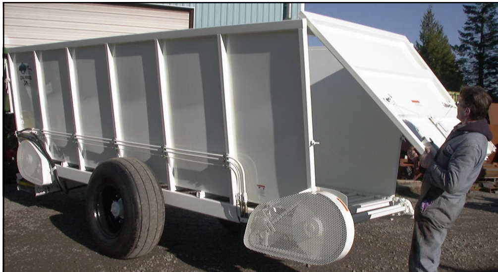
Rear door open

If your application requires a custom built machine, Call or Email us with your details and we can provide a quote. Custom machines are not a problem!