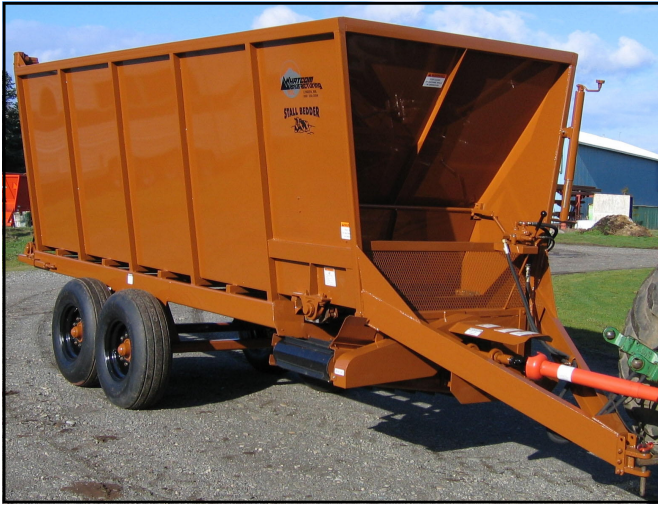
Discharge out the front as well